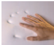
"Feeling is believing"

Luxurious pillow in NASA inspired viscous foam (developed to help astronauts absorb gravity forces), Memory Foam literally moulds and conforms to the head and neck for even support, encouraging the natural curvature of the spine. Now in two densities: Memory Original – super-soft, first version launched, for those requiring a lower pillow; and Memory Plus – heavier density for broader physiques and for those who like more 'body' in their pillow.